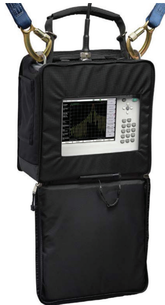
SOFT CASE OPENS IN FRONT FOR EASY ACCESS AND USE.